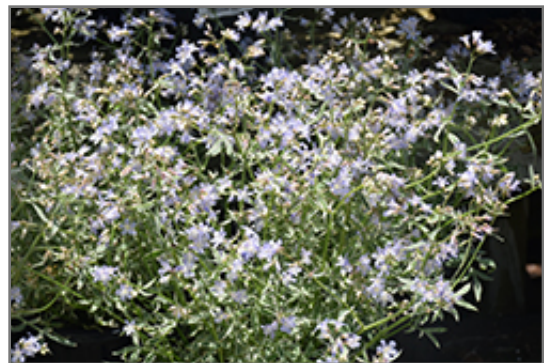
Touch Of Class Jacob's Ladder flowers