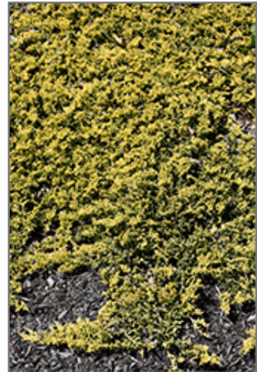
Mother Lode Juniper foliage