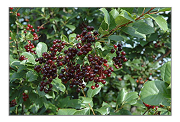
Chokecherry fruit