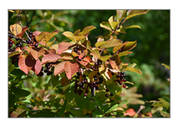
Chokecherry fruit