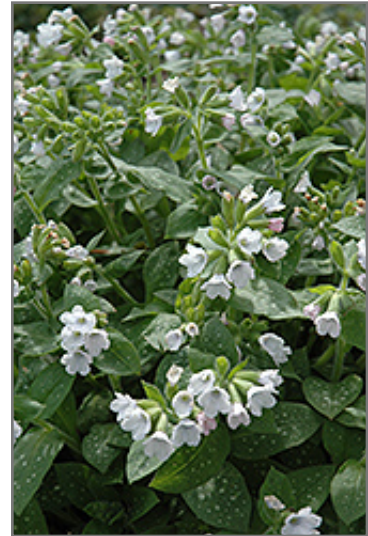
Sissinghurst White Lungwort flowers