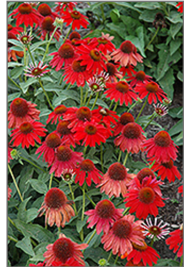
Sombrero Salsa Red Coneflower flowers

This is a relatively low maintenance plant, and is best cleaned up in early spring before it resumes active growth for the season. It is a good choice for attracting butterflies to your yard, but is not particularly attractive to deer who tend to leave it alone in favor of tastier treats. It has no significant negative characteristics.