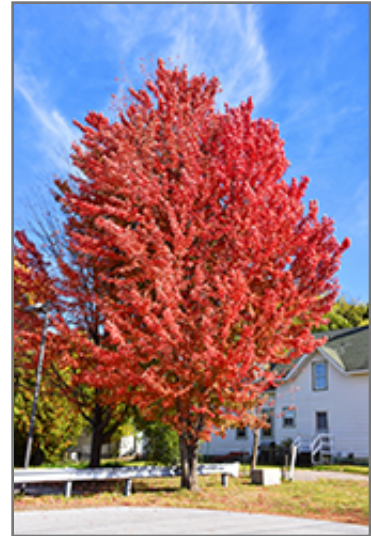
Celebration Maple in fall