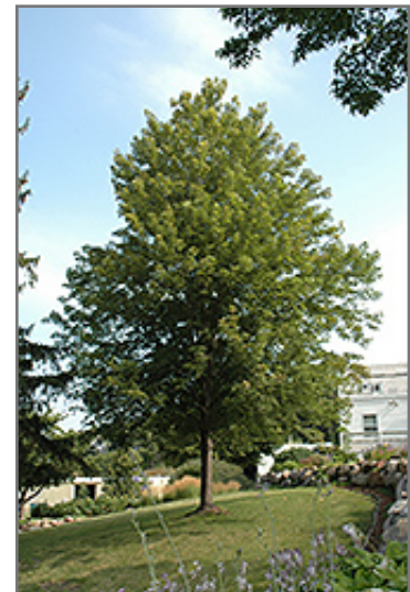
Celebration Maple