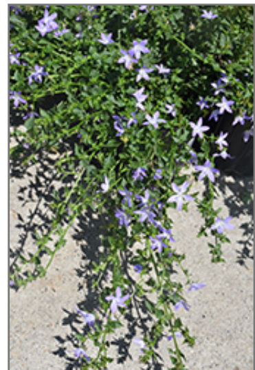
Blue Waterfall Serbian Bellflower in bloom