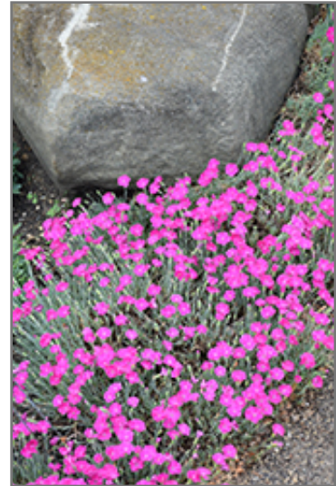
Firewitch Pinks in bloom

Firewitch Pinks is a fine choice for the garden, but it is also a good selection for planting in outdoor pots and containers. It is often used as a 'filler' in the 'spiller-thriller-filler' container combination, providing a mass of flowers and foliage against which the thriller plants stand out. Note that when growing plants in outdoor containers and baskets, they may require more frequent waterings than they would in the yard or garden. Be aware that in our climate, most plants cannot be expected to survive the winter if left in containers outdoors, and this plant is no exception. Contact our experts for more information on how to protect it over the winter months.