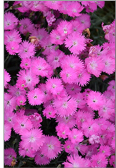
Firewitch Pinks flowers