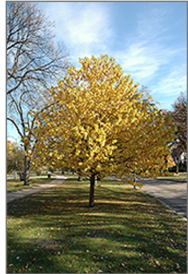
Amur Cherry in fall

This tree should only be grown in full sunlight. It does best in average to evenly moist conditions, but will not tolerate standing water. It is not particular as to soil type or pH. It is somewhat tolerant of urban pollution. This species is not originally from North America.