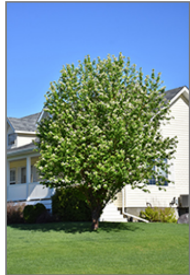
Amur Cherry