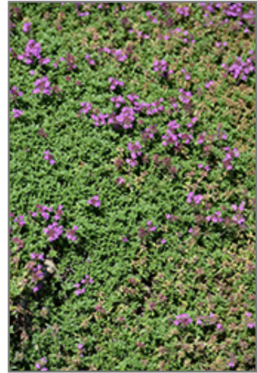
Creeping Thyme in bloom

Creeping Thyme is recommended for the following landscape applications;