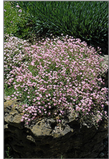
Pink Creeping Baby's Breath in bloom

Pink Creeping Baby's Breath will grow to be only 6 inches tall at maturity, with a spread of 19 inches. Its foliage tends to remain low and dense right to the ground. It grows at a fast rate, and under ideal conditions can be expected to live for approximately 10 years. As an herbaceous perennial, this plant will usually die back to the crown each winter, and will regrow from the base each spring. Be careful not to disturb the crown in late winter when it may not be readily seen!