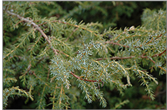
Common Juniper foliage