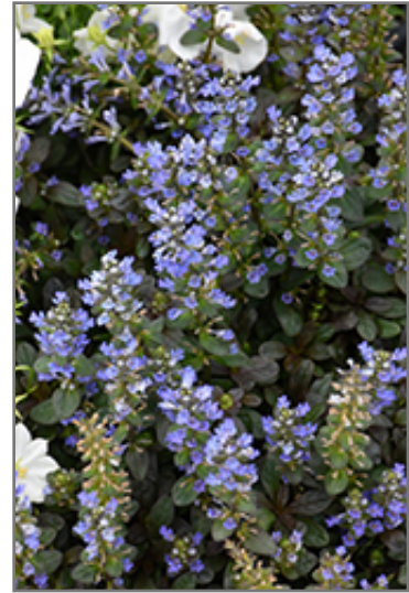
Chocolate Chip Bugleweed flowers