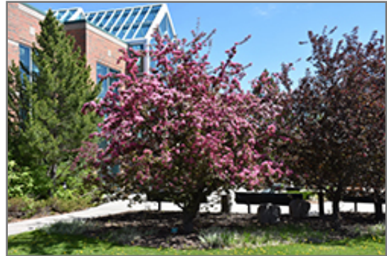
Makamik Flowering Crab in bloom

Makamik Flowering Crab is recommended for the following landscape applications;