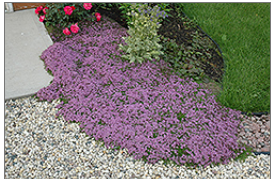
Red Creeping Thyme in bloom