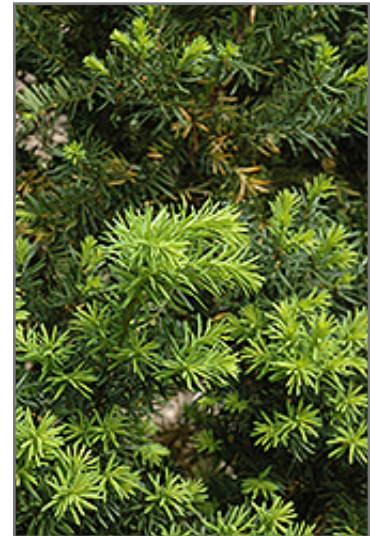
Hicks Yew foliage