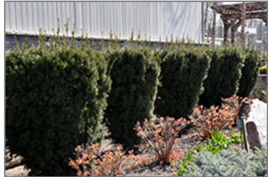
Hicks Yew

Hicks Yew will grow to be about 18 feet tall at maturity, with a spread of 10 feet. It has a low canopy with a typical clearance of 1 foot from the ground, and is suitable for planting under power lines. It grows at a slow rate, and under ideal conditions can be expected to live for 50 years or more.