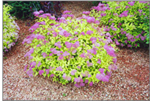
Goldmound Spirea in bloom

This shrub should only be grown in full sunlight. It prefers to grow in average to moist conditions, and shouldn't be allowed to dry out. It is not particular as to soil type or pH. It is highly tolerant of urban pollution and will even thrive in inner city environments. This is a selected variety of a species not originally from North America.