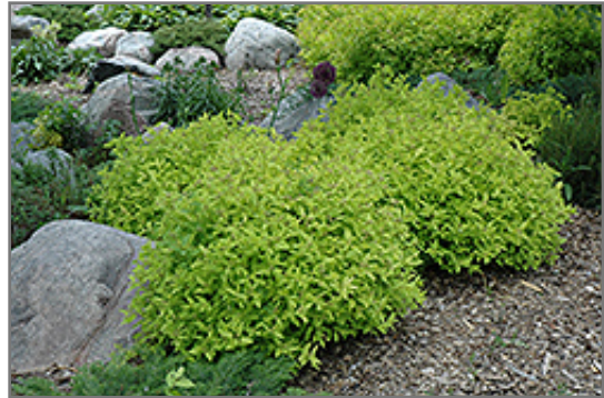
Goldmound Spirea

Goldmound Spirea is recommended for the following landscape applications;