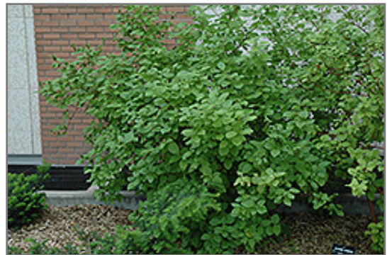
Siberian Coral Dogwood