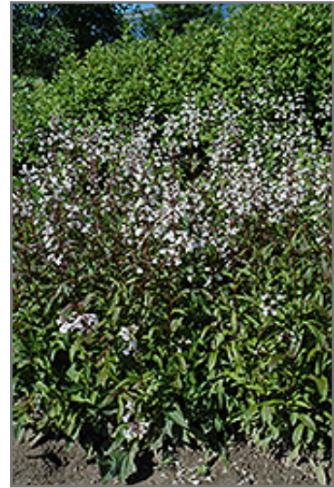
Husker Red Beard Tongue in bloom

Husker Red Beard Tongue is a fine choice for the garden, but it is also a good selection for planting in outdoor pots and containers. With its upright habit of growth, it is best suited for use as a 'thriller' in the 'spiller-thriller-filler' container combination; plant it near the center of the pot, surrounded by smaller plants and those that spill over the edges. It is even sizeable enough that it can be grown alone in a suitable container. Note that when growing plants in outdoor containers and baskets, they may require more frequent waterings than they would in the yard or garden. Be aware that in our climate, most plants cannot be expected to survive the winter if left in containers outdoors, and this plant is no exception. Contact our experts for more information on how to protect it over the winter months.