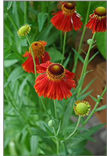
Moerheim Beauty Sneezeweed flowers