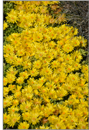
Yellow Ice Plant flowers

Yellow Ice Plant is recommended for the following landscape applications;