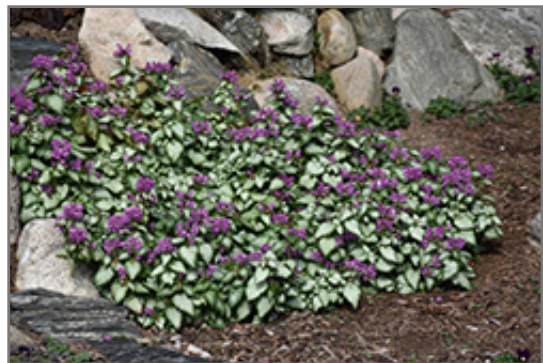
Purple Dragon Spotted Dead Nettle in bloom