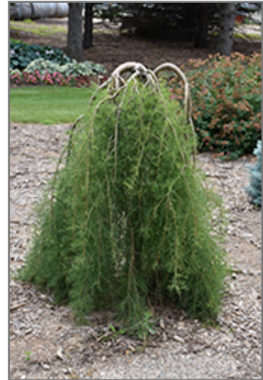
Walker Weeping Caragana

This shrub does best in full sun to partial shade. It prefers dry to average moisture levels with very well-drained soil, and will often die in standing water. It is considered to be drought-tolerant, and thus makes an ideal choice for xeriscaping or the moisture-conserving landscape. It is not particular as to soil type or pH, and is able to handle environmental salt. It is highly tolerant of urban pollution and will even thrive in inner city environments. This is a selected variety of a species not originally from North America.