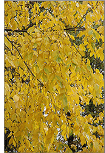
American Elm in fall

This tree should only be grown in full sunlight. It is an amazingly adaptable plant, tolerating both dry conditions and even some standing water. It is not particular as to soil type or pH, and is able to handle environmental salt. It is highly tolerant of urban pollution and will even thrive in inner city environments. This species is native to parts of North America.