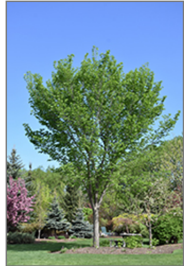
Brandon Elm