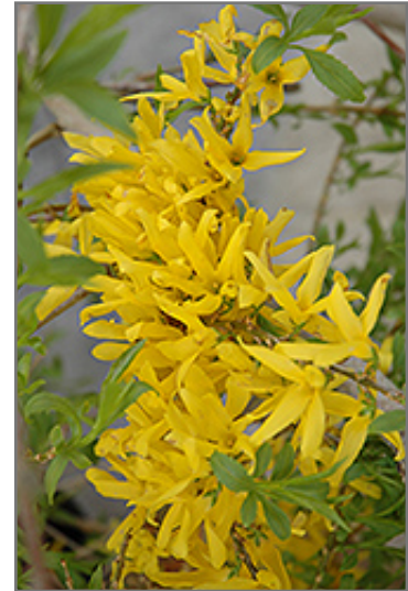
Gold Tide Forsythia flowers

Gold Tide Forsythia is recommended for the following landscape applications;