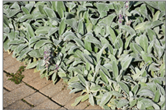
Lamb's Ears

Lamb's Ears is a fine choice for the garden, but it is also a good selection for planting in outdoor pots and containers. It is often used as a 'filler' in the 'spiller-thriller-filler' container combination, providing a mass of flowers and foliage against which the thriller plants stand out. Note that when growing plants in outdoor containers and baskets, they may require more frequent waterings than they would in the yard or garden. Be aware that in our climate, most plants cannot be expected to survive the winter if left in containers outdoors, and this plant is no exception. Contact our experts for more information on how to protect it over the winter months.