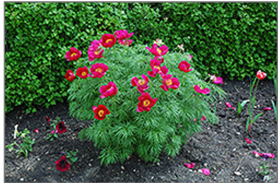
Japanese Fernleaf Peony in bloom