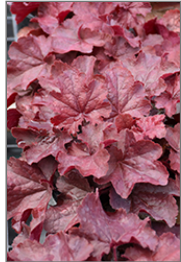
Northern Exposure Red Coral Bells foliage

Northern Exposure Red Coral Bells is recommended for the following landscape applications;