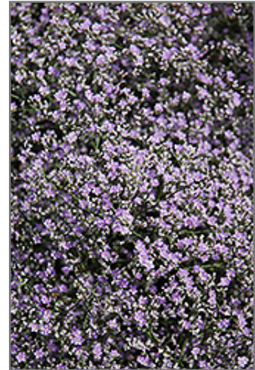
Sea Lavender flowers