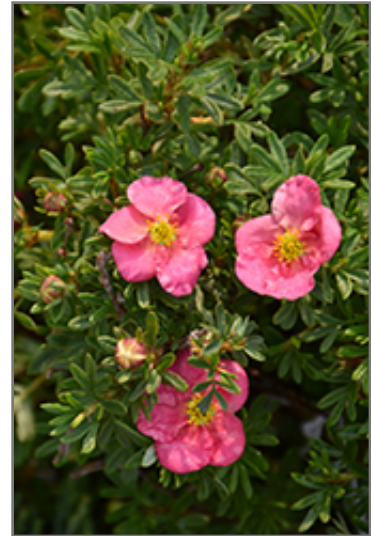
Bella Bellissima Potentilla flowers