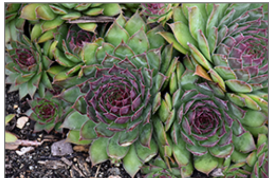
Black Hens And Chicks