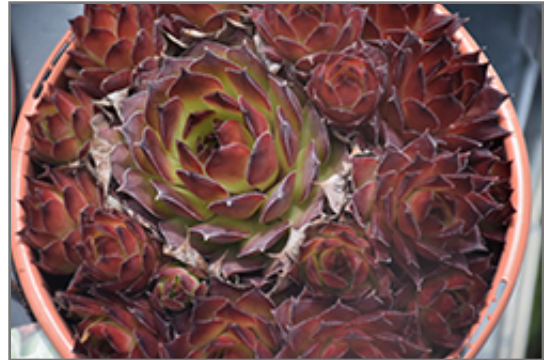
Black Hens And Chicks

Black Hens And Chicks is a fine choice for the garden, but it is also a good selection for planting in outdoor pots and containers. It is often used as a 'filler' in the 'spiller-thriller-filler' container combination, providing a canvas of foliage against which the larger thriller plants stand out. Note that when growing plants in outdoor containers and baskets, they may require more frequent waterings than they would in the yard or garden. Be aware that in our climate, most plants cannot be expected to survive the winter if left in containers outdoors, and this plant is no exception. Contact our experts for more information on how to protect it over the winter months.