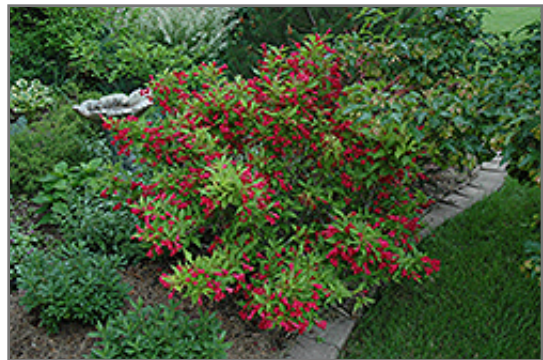
Red Prince Weigela in bloom