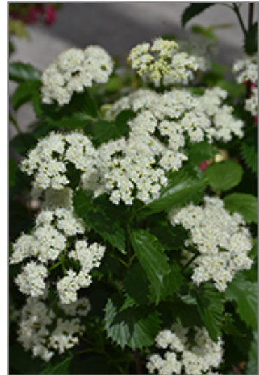
Blue Muffin Viburnum flowers