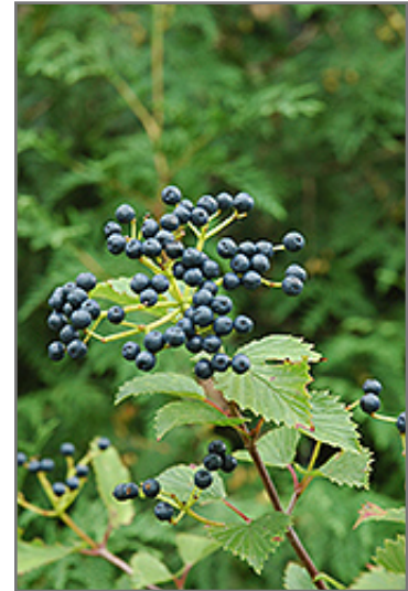
Blue Muffin Viburnum fruit

Blue Muffin Viburnum is recommended for the following landscape applications;