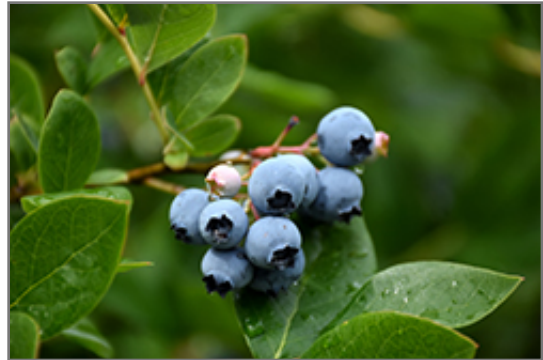
Northcountry Blueberry fruit

Northcountry Blueberry features dainty clusters of white bell-shaped flowers with shell pink overtones hanging below the branches in mid spring. It has green deciduous foliage. The glossy oval leaves turn an outstanding scarlet in the fall. It features an abundance of magnificent blue berries in mid summer.