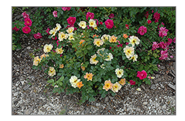
Morden Sunrise Rose in bloom