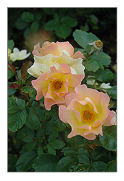
Morden Sunrise Rose flowers