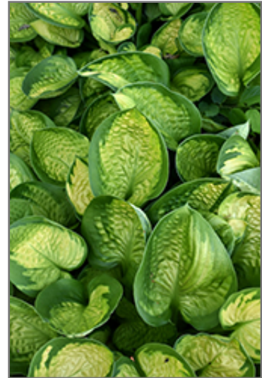
Rainforest Sunrise Hosta foliage

Rainforest Sunrise Hosta is recommended for the following landscape applications;