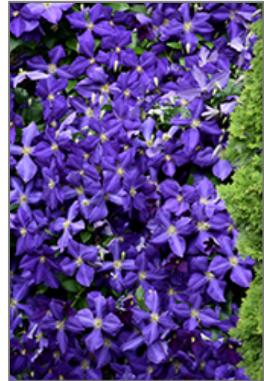
Jackmanii Clematis in bloom