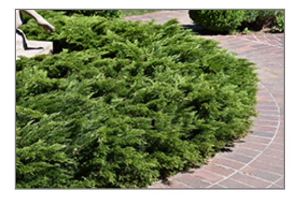
Calgary Carpet Juniper