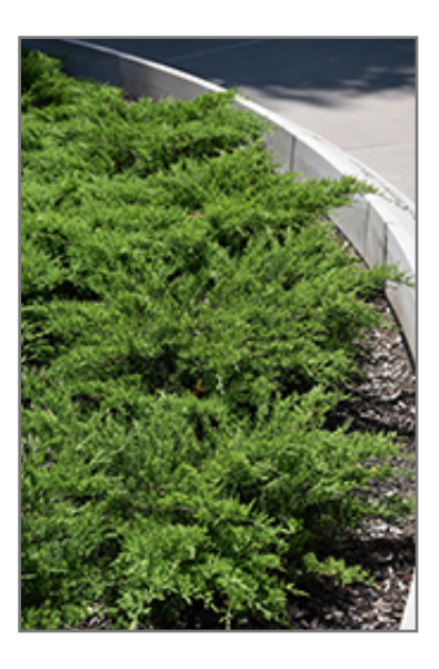
Broadmoor Juniper