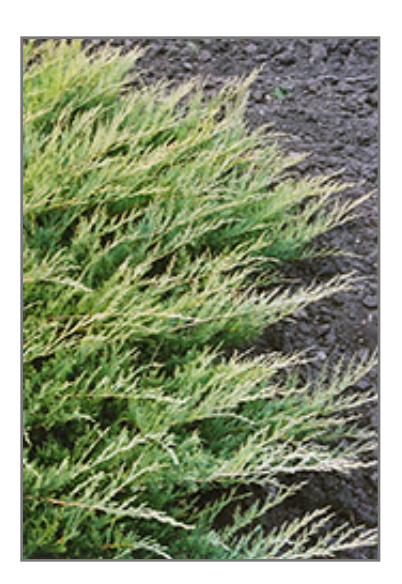
Broadmoor Juniper foliage