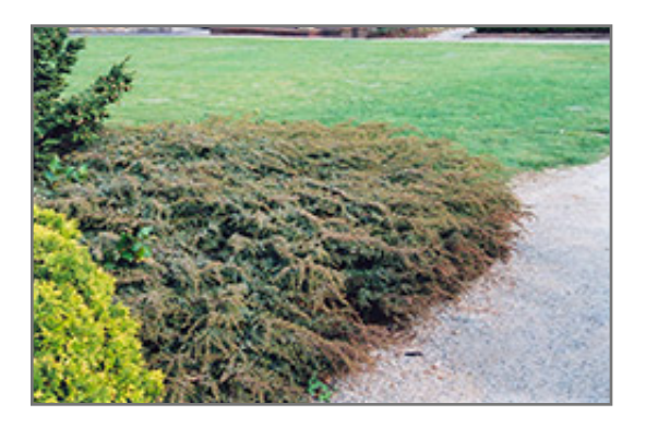
Effusa Juniper