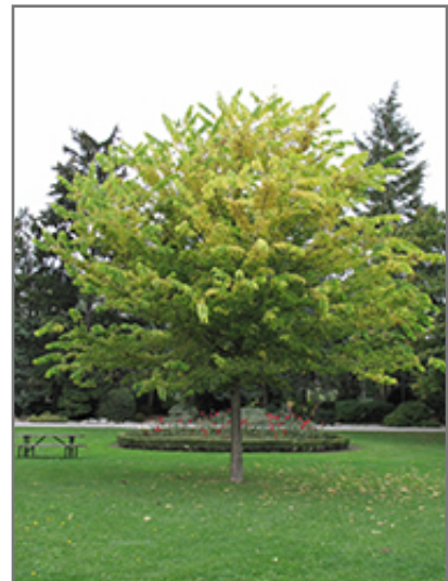
Common Hackberry in fall