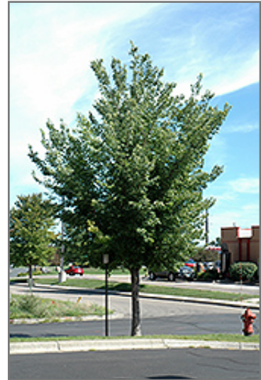
Common Hackberry