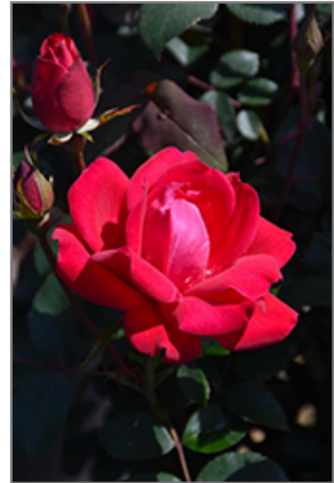
Double Knock Out Rose flowers

Double Knock Out Rose is recommended for the following landscape applications;