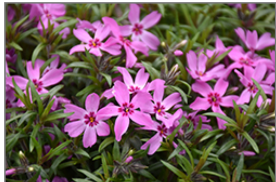
Crimson Beauty Moss Phlox flowers