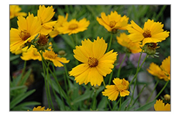
Baby Sun Tickseed flowers