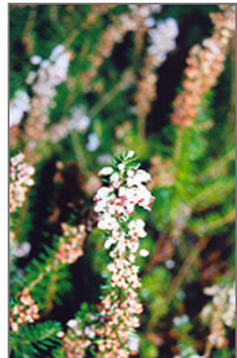
Scotch Heather flowers