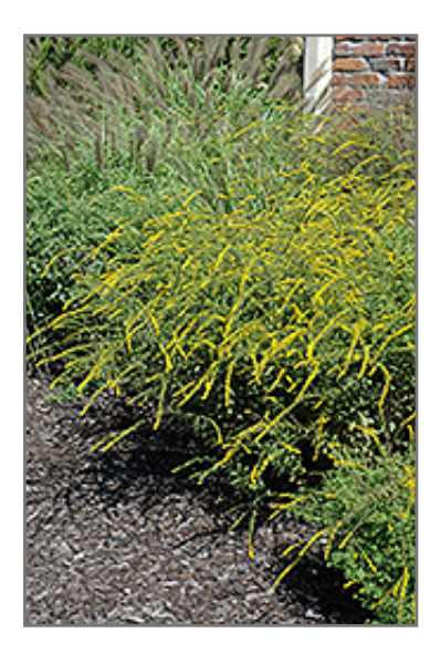
Fireworks Goldenrod flowers