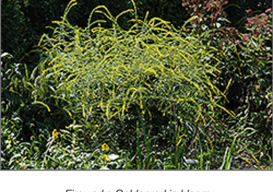
Fireworks Goldenrod in bloom