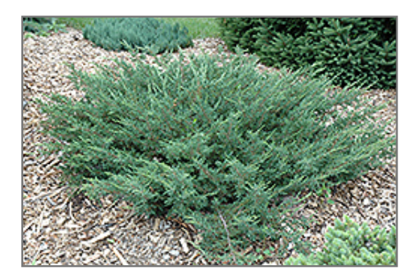
Alpine Carpet Juniper