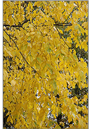
American Elm in fall

This tree should only be grown in full sunlight. It is an amazingly adaptable plant, tolerating both dry conditions and even some standing water. It is not particular as to soil type or pH, and is able to handle environmental salt. It is highly tolerant of urban pollution and will even thrive in inner city environments. This species is native to parts of North America.