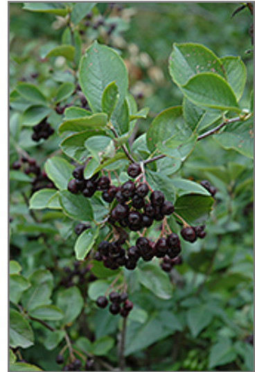
Black Chokeberry fruit