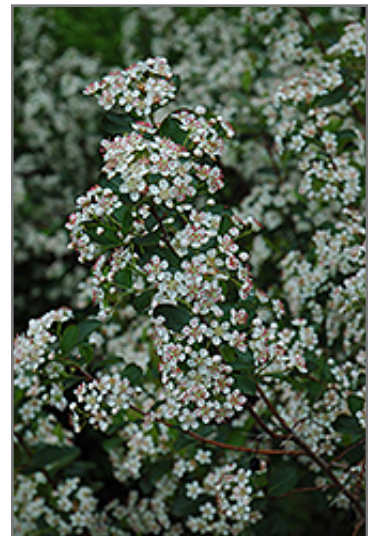
Black Chokeberry flowers